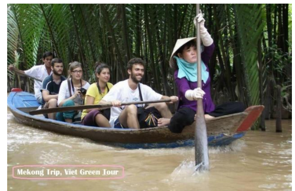
Mekong Trip, Viet Green Jour

Accommodation: Hotel in Ho Chi Minh City