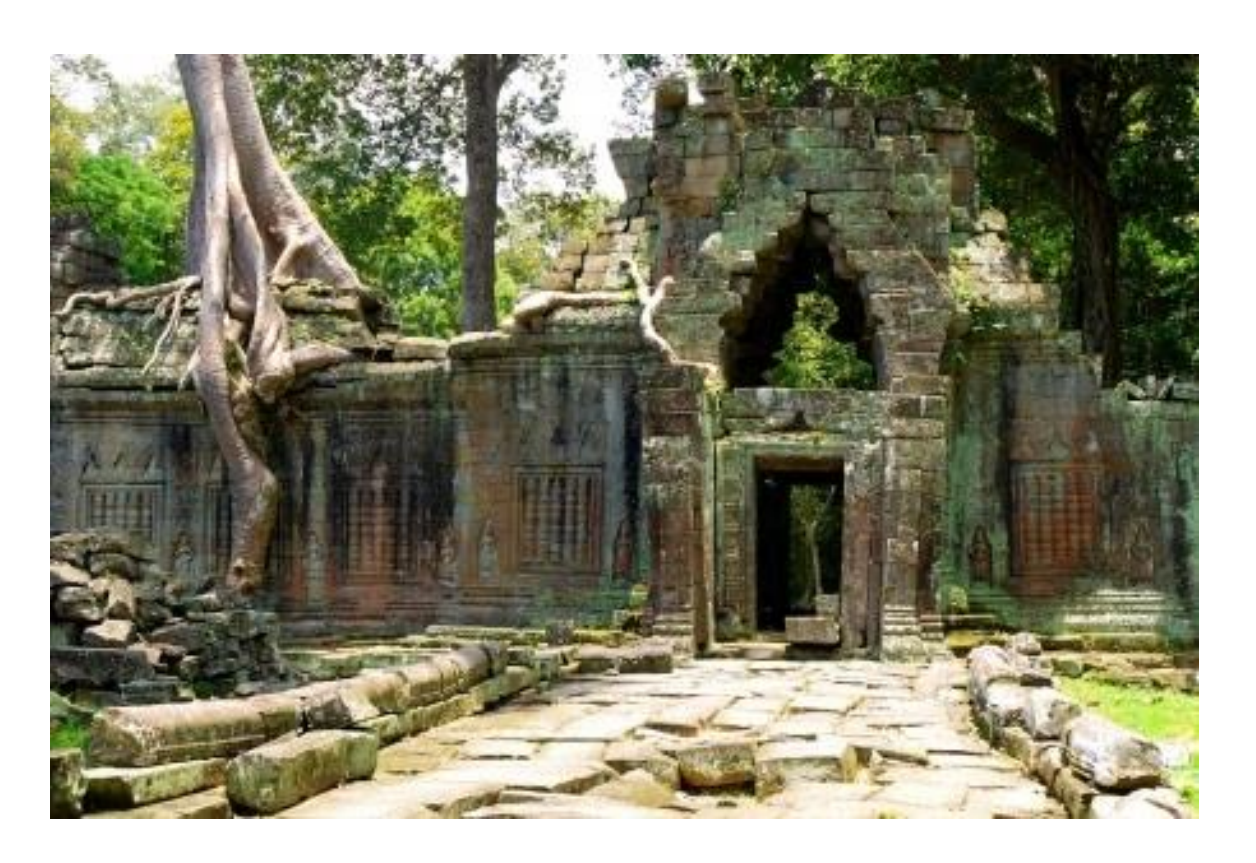
Day 2: Siem Reap – Angkor Thom – Angkor Wat – Bakheng Sunset

After breakfast at hotel, we go out to visit the antique capital of Angkor Thom (12 century): the South Gate with its huge statues depicting the churning of the ocean of milk, the Bayon Temple, unique for its 54 towers decorated with over 200 smiling faces of Avolokitesvara, the Phimeanakas, the Royal Enclosure, the Elephants Terrace and the Terrace of the Leper King.