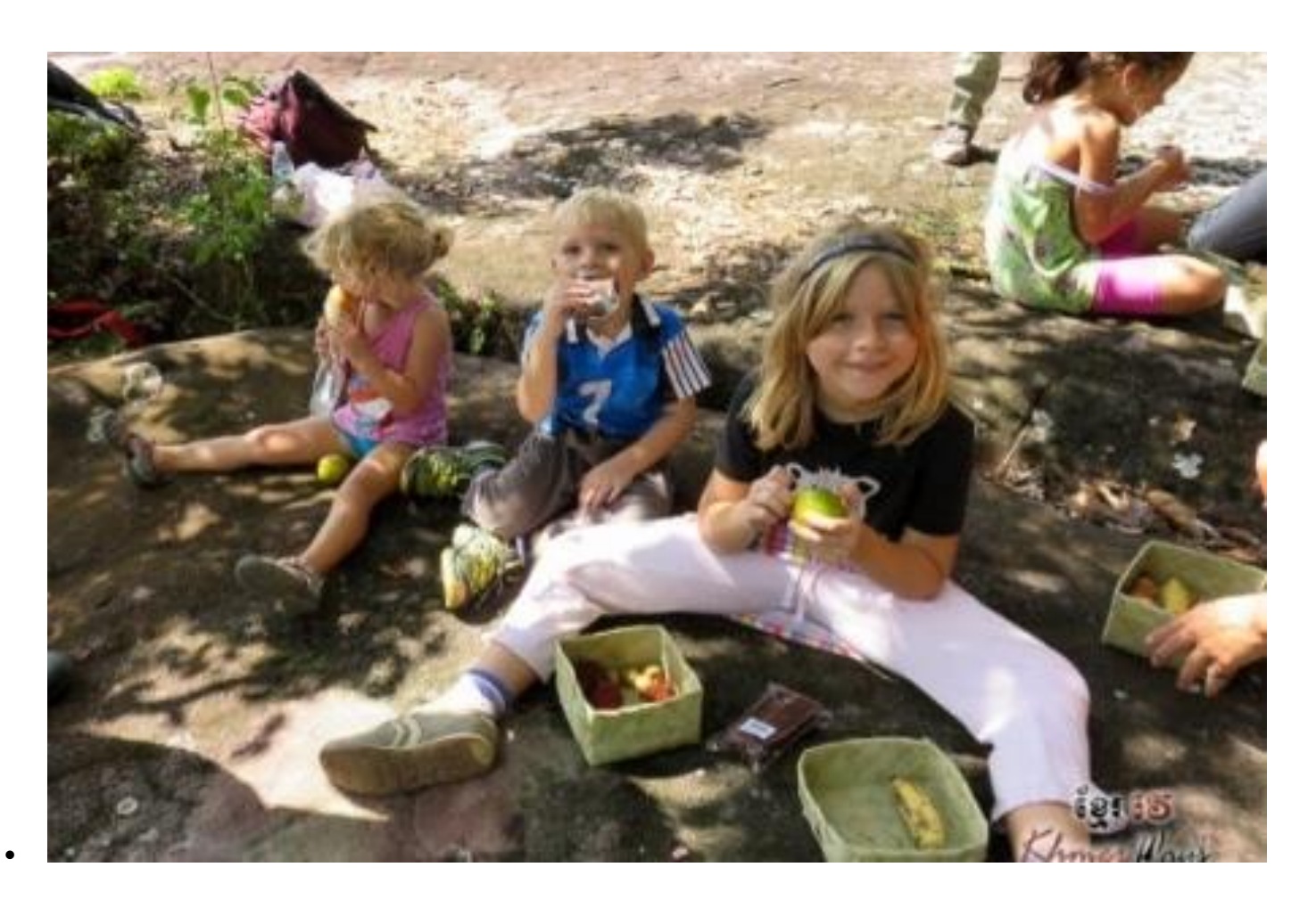
Day 4: Private Jeep Tour – Beng Melea – Kampong Khleang

In the morning, we will leave from your accommodation to drive through the Cambodian 'outback'. About 60 kilometers outside of Siem Reap lies the mysterious 12th century Beng Melea temple which is heavily overrun by trees, vines and moss. Parts of the way to these 'forgotten' temples are red colored clay paths with green shrubs along both sides. This jungle like surrounding makes you enjoy your jeep tour even more as we continue our day trip to the largest stilted village of Cambodia, Kampong Kleang named.