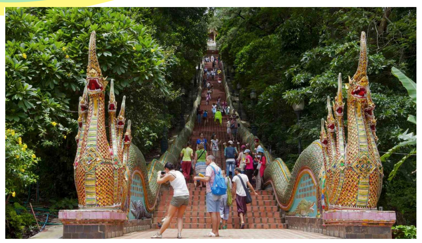
Conquer The Top Of Wat Phra That Doi Suthep