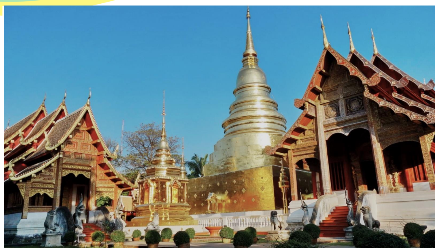
Wat Phra Singh The Best Place To Check Out Classic Lanna Art And Historical Literature