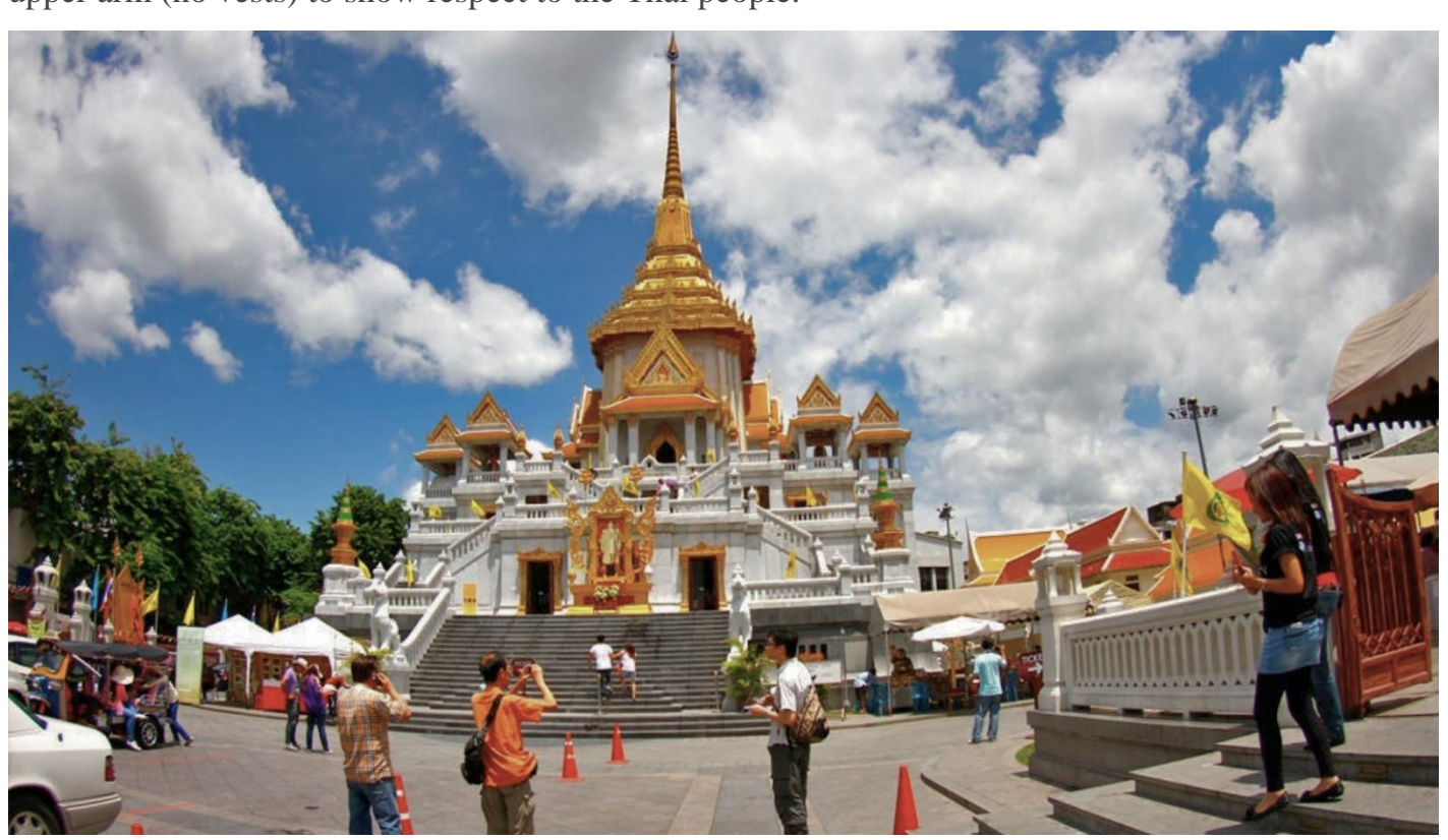
The Golden Colour Of Wat Traimit

NOTE: It is recommended to wear long pants, shoes that cover the heel, and shirts that cover the upper arm (no vests) to show respect to the Thai people.