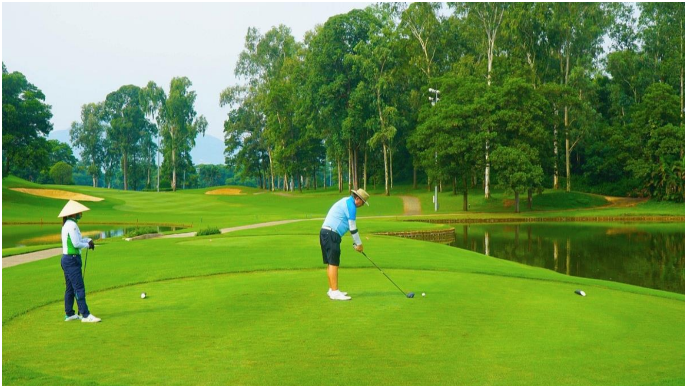
Hanoi Golf Club

Stay overnight at your luxury hotel in Hanoi