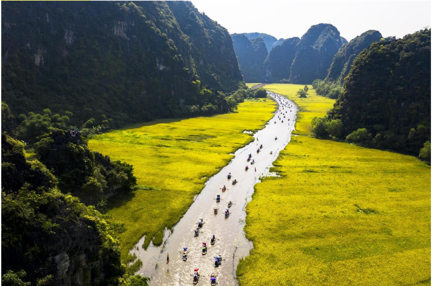
Beautiful Ninh Binh Scenery