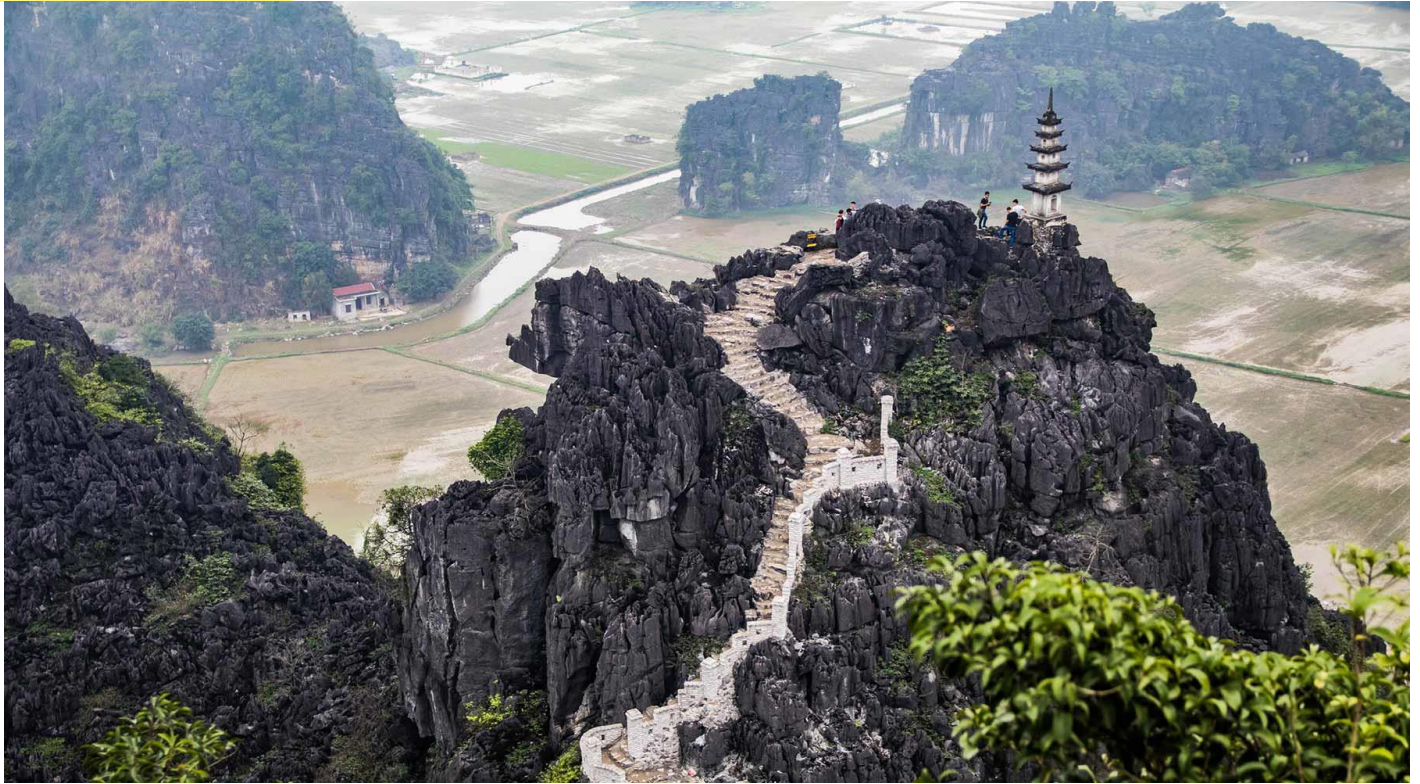
Get A Panoramic View Of Ninh Binh From Mua Cave