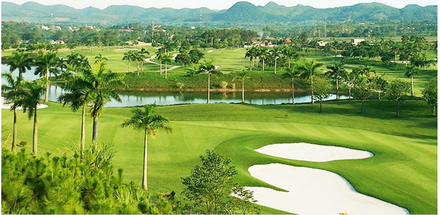
Trang An Golf Club