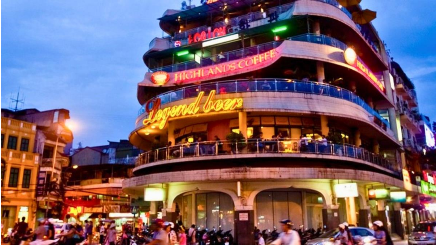
Discover Hanoi Old Quarter

NOTE: Please contact our sales consultants if you cannot find our tour guide at the airport.