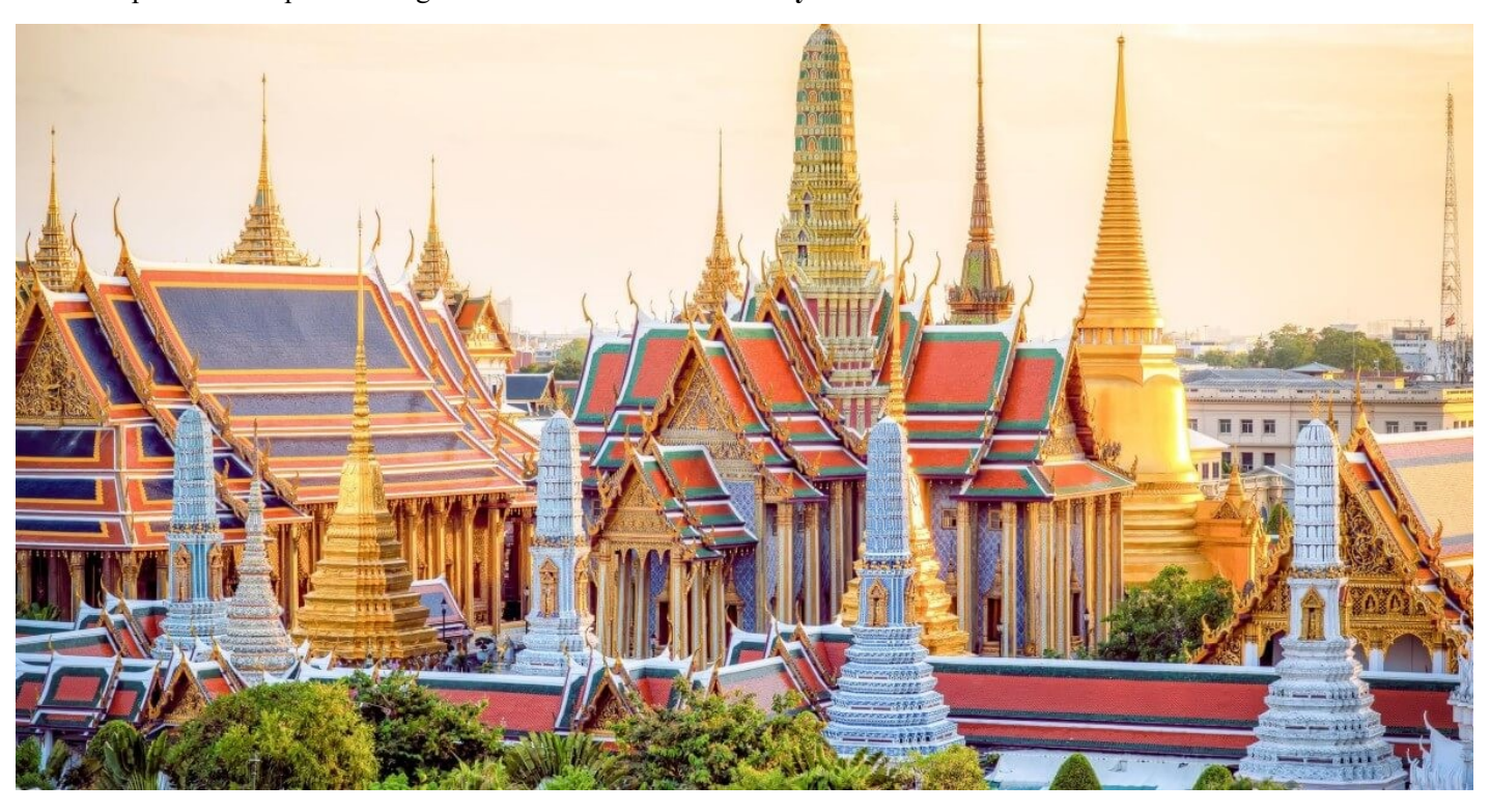
Visit Wat Pho - The Largest And Oldest Wats

A tour of Bangkok's Thonburi side will not be complete without the spectacular and iconic <u>Wat Arun</u> - where you will take time to explore the temple towering 79 meters over the Chao Phraya River .