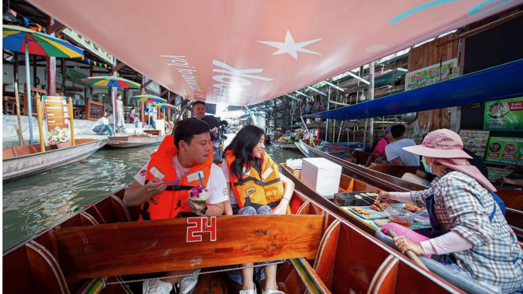
Try Local Food At Damnoen Saduak Floating Market

This full-day tour includes lunch at a local restaurant, all admission fees and transfers to and from your hotel in Bangkok.